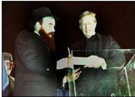
President Jimmy Carter (1977-1981)